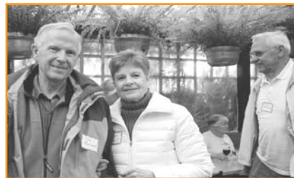
Farwells and Vyfvinkels