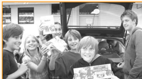
Santa Rita Elementary School, Los Altos